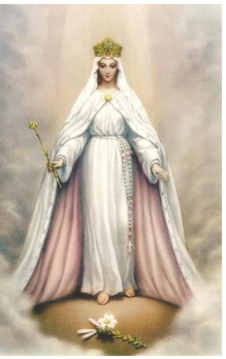
Our Hope Mary Immaculate Queen of the Universe