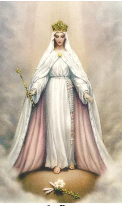
Our Hope Mary Immaculate Queen of the Universe