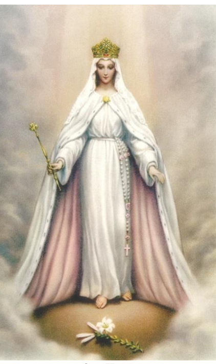
Our Hope Mary Immaculate Queen of the Universe

Our Father, Hail Mary and Glory be three times. An indulgence of 500 days. A plenary indulgence on the usual conditions, if this prayer is repeated with devotion every day for a month.